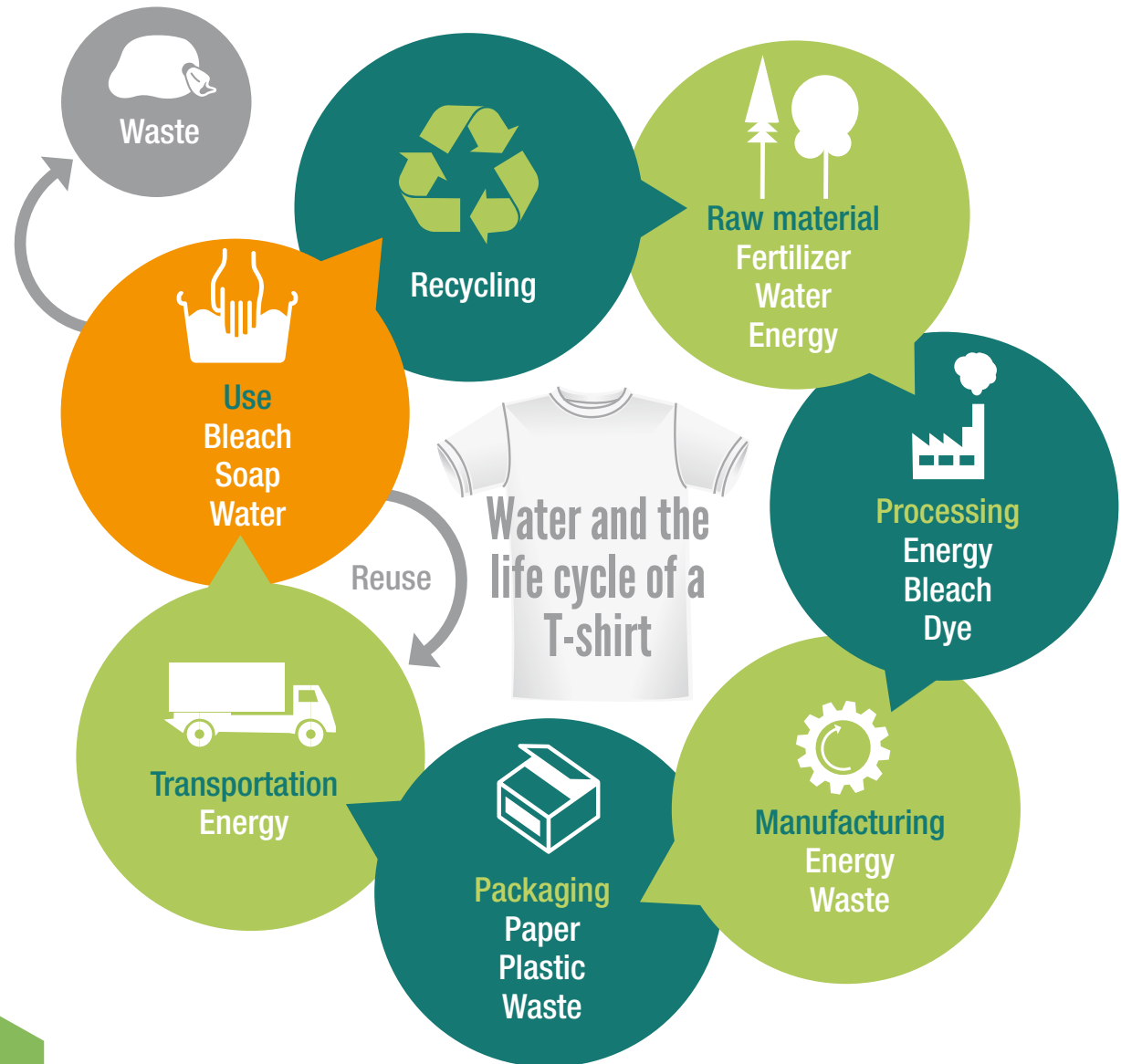
Figure 1. Water and the life cycle of a t-shirt

To produce a kilo of cotton, an average of 10,000 liters (2,642 gallons) of water is used; roughly 250 grams of cotton is required to make a T-shirt or shirt (Water Footprint, 2012). This means that part of what you are wearing today may have required about 2,500 liters (660 gallons) of water!