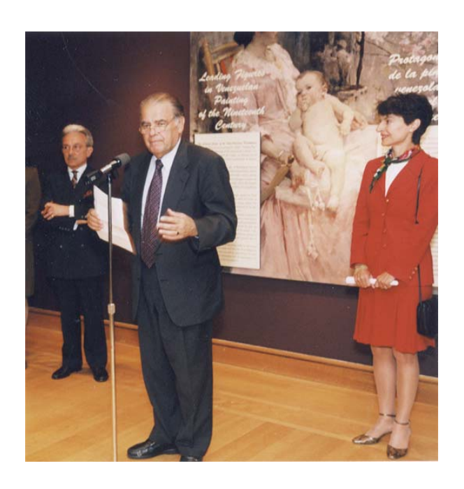
IDB President Enrique V. Iglesias formally inaugurates the exhibition ALeading Figures in Venezuelan Painting of the Nineteenth Century≅ in the Cultural Center Art Gallery.

In addition to an exhibition featuring 49 outstanding works from the IDB Art Collection , in 1999 the entire collection (1,520 works) was physically inventoried, and 500 of the most valuable and historically significant works were professionally appraised.