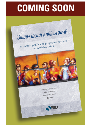
Order at Amazon.com